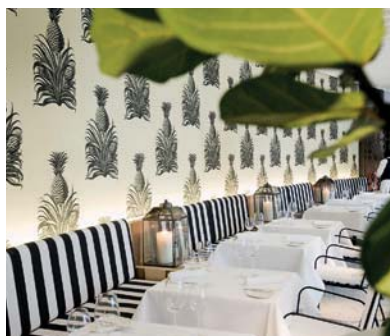
Garden Court Restaurant